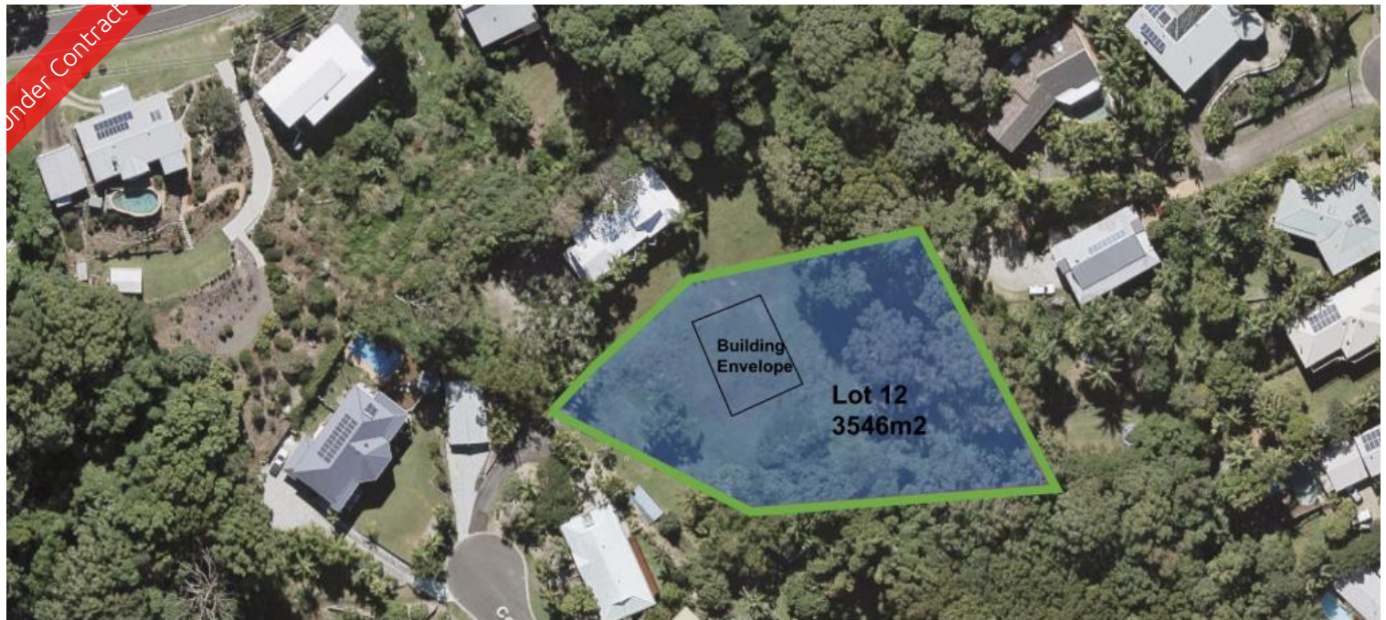
Lot 12, 38 Conway Ct, Bli Bli