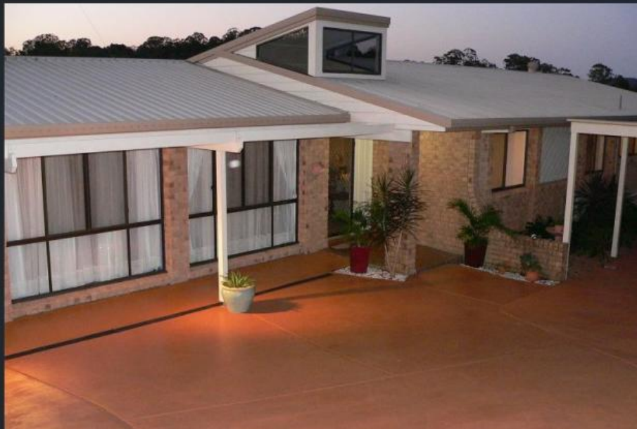
14 Argyle Cres, Coes Creek