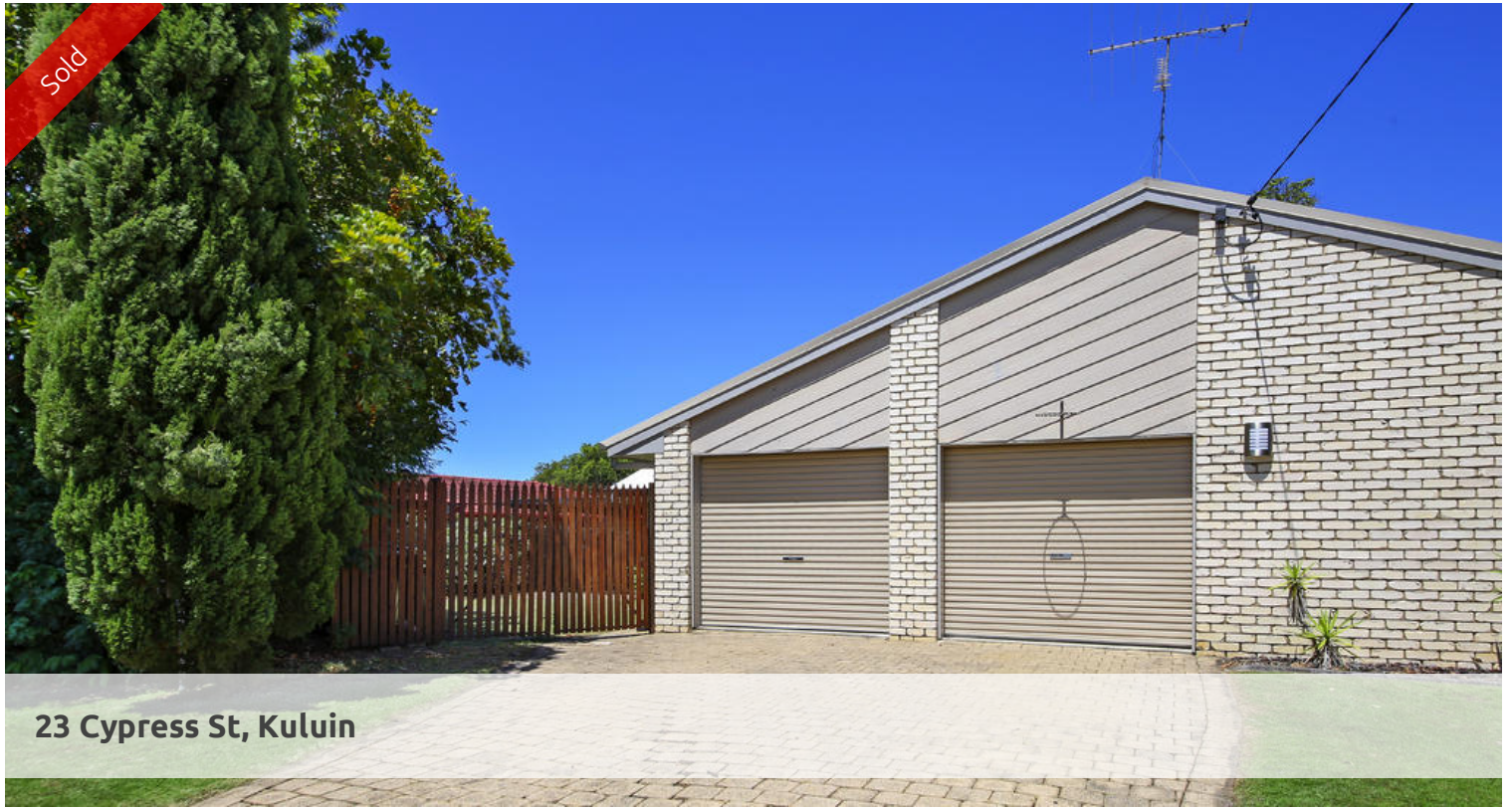
23 Cypress St, Kuluin